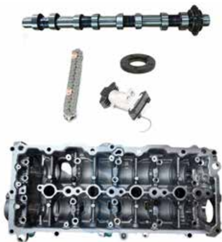
FRECCIA REFERENCE CM05-2440