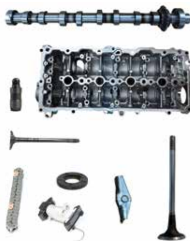
FRECCIA REFERENCE CM05-2441